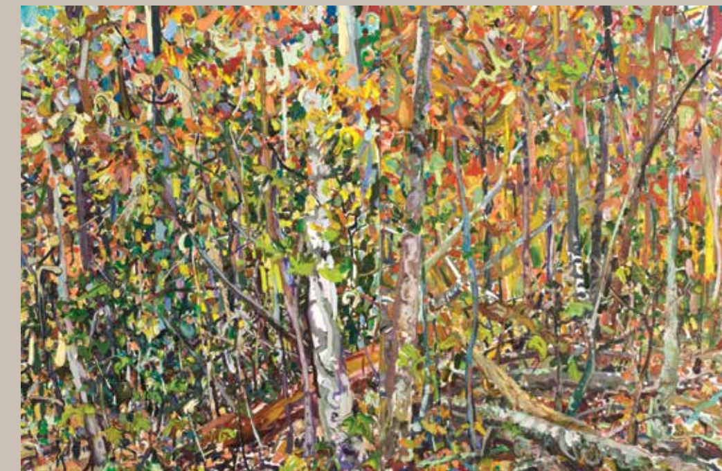
Hambidge Autumn (GA) (diptych), 2011 oil on canvas 48" x 72"