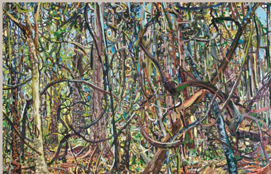
Hyperbolic Nature: Florida Vines (diptych), 2008 oil on canvas 60" x 96"

In a virtualized world, one could consider perceptual plein-air painting to be an act of defiance. As passé as it may seem to some, my current postmodern plein-air painting practice is both relevant and potent to me. I believe that the very act of making and viewing perceptually based, plein-air painting invites discourse on our own ability to have a meaningful, even sublime experience of nature today. As I continue to work in and with nature, I think about what Thoreau said: "You must live in the present, launch yourself on every wave, find your eternity in each moment." There is a similar imperative and urgency about my paintings. There is a strong sense in my works that nature is intoxicatingly near and yet unreachable... just out of one's grasp. Nature won't settle down, be passive, or ever fully reveal itself. But, at the same time, it will offer us more than we seek. I can only hope my paintings can do the same.