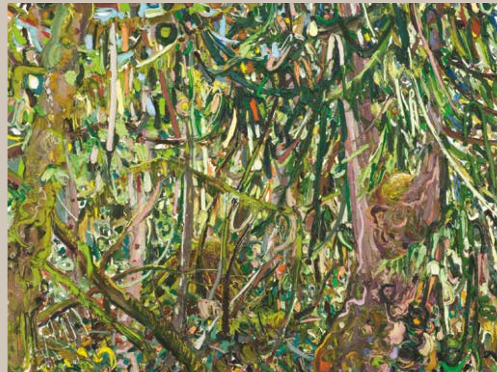
Webbed Woods (WA) , 2009 oil on canvas 36" x 48", (detail on cover)

James Surls will give a gallery talk at 5:30 on Thursday, November 13. A reception with light refreshments will follow. The event and reception are free, and the public is cordially invited.