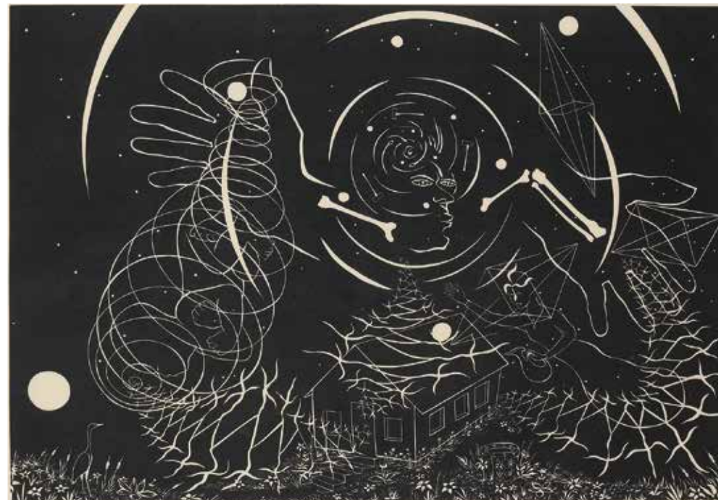
Well Water , 1991 linocut 39.5" x 53"

Art will always speak the truth. Art will not lie. Art gives you all that you need to understand it. The issue of "not understanding the art" does not live inside the art; it lives inside the spectator. The question is, how ready are you to have a conversation with an object, giving it the full ability to converse with you? To tell you the truth, few are ready to have such a conversation. But for the ones who are, the stakes are high and the rewards are many. I will say I personally appreciate any and all who stand before my art with the questions, ready to ask: Art, what are you? What are you saying to me? Why do you expect me to look at you for this extended period of time? Look through the art to what is beyond. It will then speak a clear language and one that will tell you what you need.