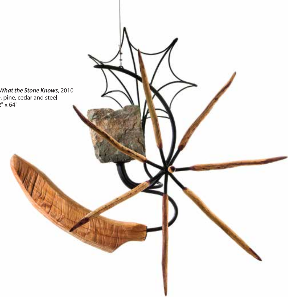
Knowing What the Stone Knows , 2010 riverstone, pine, cedar and steel 102" x 102" x 64"