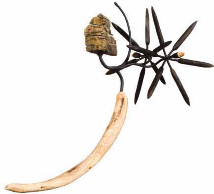
Me with Two Flowers and the Stone's Face , 2009 aspen, bass, steel and stone 59" x 69" x 27", (detail on cover)

Internationally acclaimed contemporary artist, James Surls , is largely known for his sculptures, drawings, and prints inspired by nature and human form. His work is featured in the collections of the Guggenheim and the Museum of Modern Art in New York, as well as many others. Surls has been included in over 350 solo, group, and gallery exhibitions and featured in over 425 publications. His exhibitions have spanned as far as Australia, Beijing, China, and Monte Carlo, Monaco. He has won numerous awards including the Texas Medal of Arts Award in Visual Arts by the Texas Cultural Trust in 2013, Texas State Artist by the Texas Commission on the Arts in 2006, and Texas Artist of the Year by Art League of Houston in 1991.