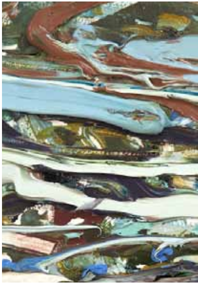
Detail, 18. Fluid Waters I: Afternoon

evaporation and condensation. And, as a fluid, it can assume any shape and take any direction. Its natural movement is downward — “seeking its level” in accord with the universal force of gravity — but evaporation (and at times