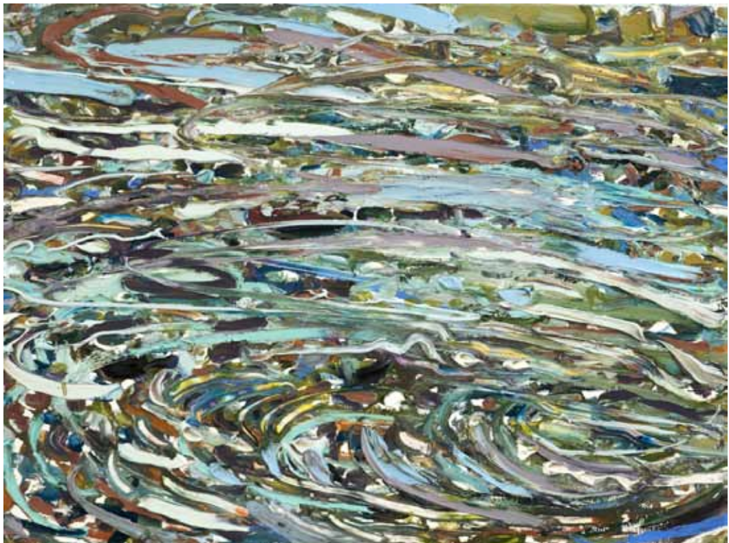
18. Fluid Waters I: Afternoon