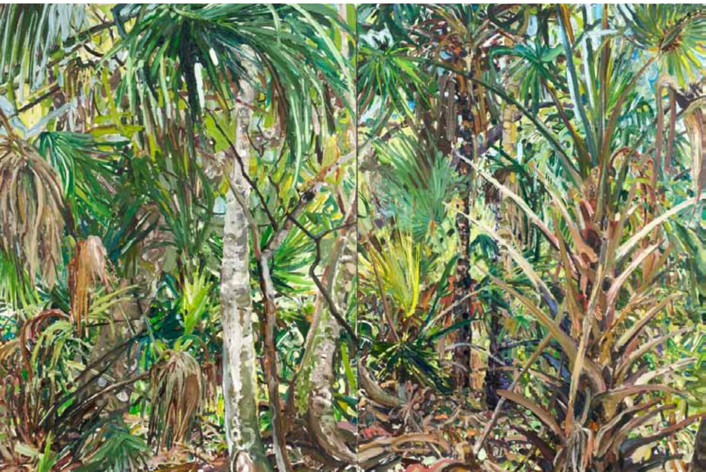
Cover: 20. Fluid Waters II: Morning Above: 4. Palm Menagerie Back Cover: 3. St. Mark's Inlet

© 2011 Polk Museum of Art. All rights reserved.