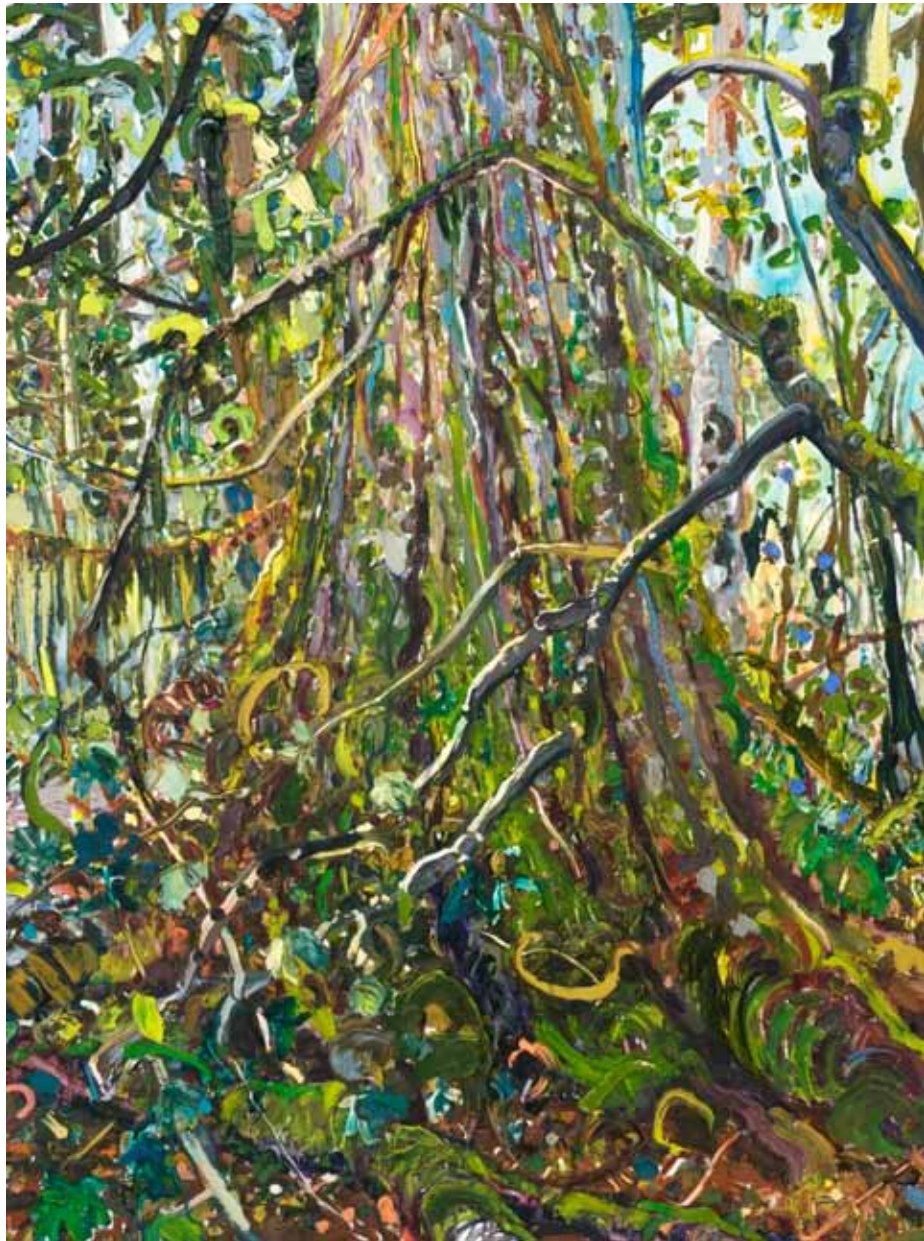
16. Mossy Hemlock

The fact that Garcia-Roig renders these related features — flowing water, a stream bed underneath, reflections of sky above — evokes for me an experience recorded in another era in a different medium: what Henry David Thoreau wrote at Walden in 1854. Moving water fascinated Thoreau just