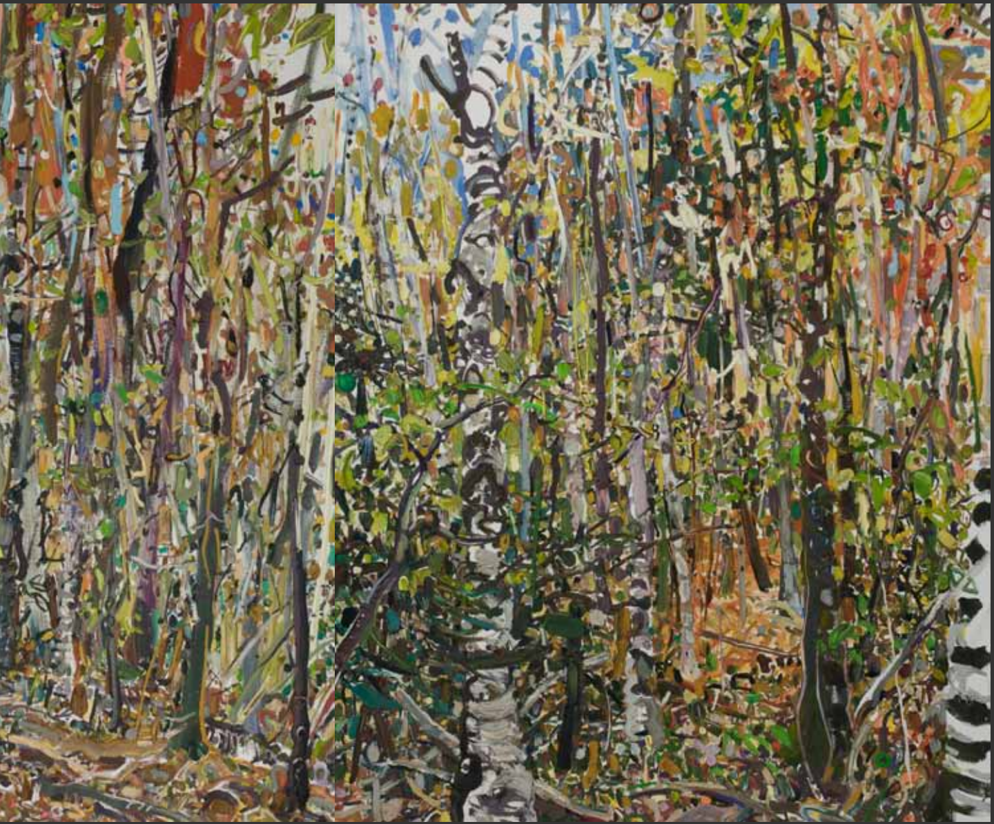
9. Hyperbolic Nature: Yellow Autumn