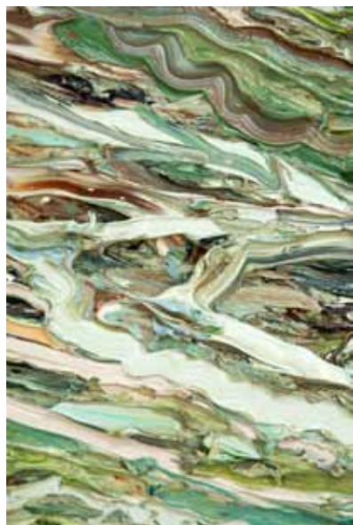
Detail, 20. Fluid Waters II: Morning

“Eternity remains,” Thoreau concluded long ago, out in the woods. This realization might apply just as well to Garcia-Roig’s renderings of dense forests or streaming water. Eternity remains, while the painter often works to compress into a single surface the changing illumination of the entire span of daylight, hour by hour, for as many as three successive days. One day in 2010, she slipped out of her usual custom, having been especially pleased